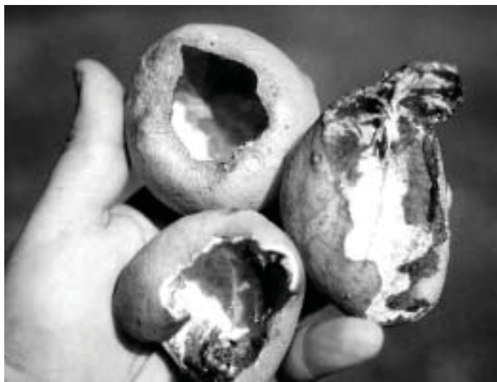
Figure 2. Empty orange rinds remaining from roof rat feeding.

Roof rats are omnivores (plant- and animal-eating). They are very fond of fruit, especially oranges ( Figure 2 ). In addition to citrus they will feed on fruit-producing ornamentals, dates, stored food, birdseed in feeders, insects, snails, and garbage. These rats will also feed on stored food and livestock feed and will contaminate much more than they actually eat. They obtain much of their water requirement from their food, but unless their diet includes a sufficient amount of succulent plant material,