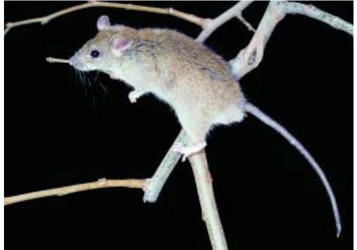
Figure 1. Roof rat.

The roof rat is somewhat similar to the Norway rat and to native pack rats ( Neotoma spp.) and cotton rats ( Sigmodon spp.) in appearance. A quick or casual observation of any one of these rats can easily result in misidentification. However, the ecology and behavior of roof rats differ significantly from that of Norway rats and native rats. These ecological and behavioral differences are important to consider when implementing control methods.