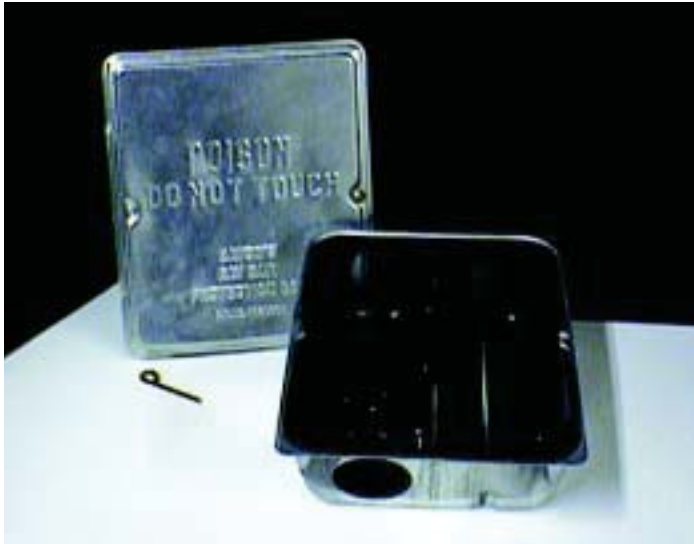
Figure 6. Bait station.

Whenever poison baits are used, all label directions must be explicitly followed. To protect against non-target toxicity, poison baits should be placed in a manner which prevents access to the bait by children, pets, and other non-target species. Where children, pets, or other wildlife may have access, tamper-resistant bait stations are to be used in accordance with label instructions. Bait stations (Figure 6) may be available from local hardware or feed stores and pest control suppliers.