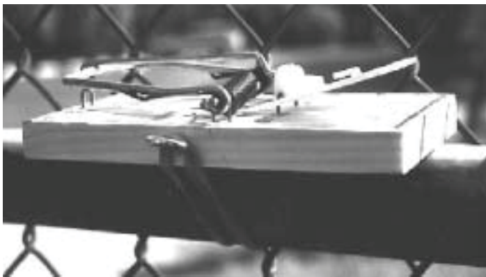
Figure 5. Snap trap.

Traps set outdoors on trees or fences should be set only from dusk to dawn to avoid accidentally trapping non-target species like squirrels and protected birds. These animals are diurnal (active during the day) while rats are nocturnal (active during the night).