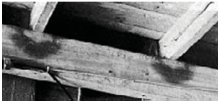
Figure 3. Roof rat smudge marks.

Roof rat signs include smudge marks on surfaces from oil and dirt rubbing off their fur as they travel ( Figure 3 ). Because of their propensity to climb, look for these smudges up high on structures, e.g. between rafters, as opposed to marks along walls near the floor which could be made by other rodent species. Because they are often living overhead, between floors or above false ceilings, there is less tendency to see signs of roof rat tracks, urine, and droppings.