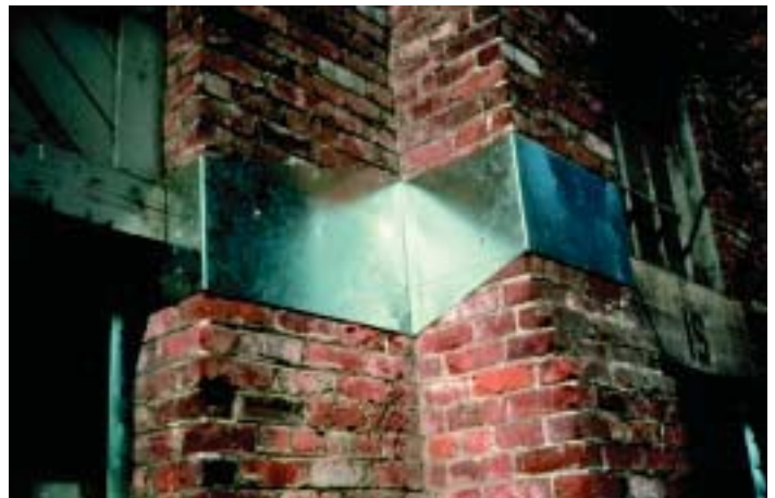
Figure 4. Rat guard.